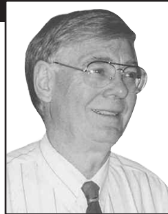
Bobby G. Boozer, D.D.S., Inc.

...to help improve your smile we offer dentures, fillings, crowns, bleaching, bonding, & implants... A smile is worth 1,000 words!